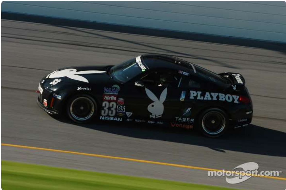
A 350Z finished fourth, on January 26, in the 200 mile GrandAm Cup race at Daytona.