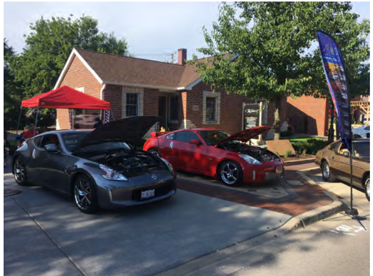
Plainfield Cruise Night