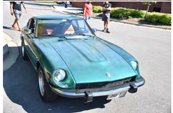
Supercar Saturday