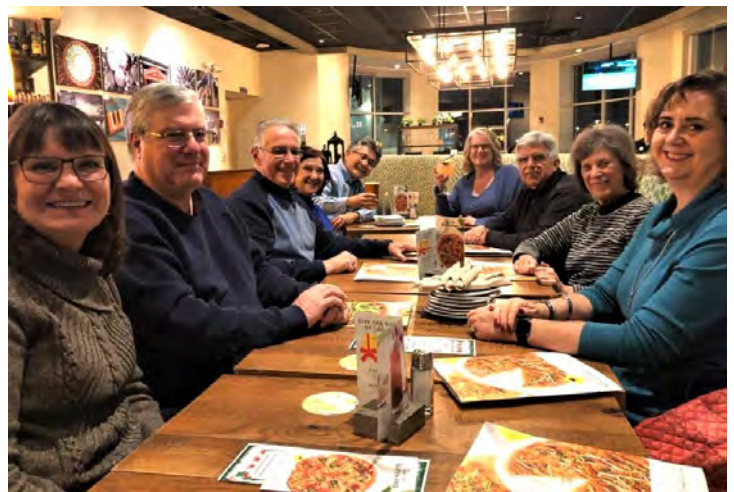
Ford v. Ferrari Dinner

WCZC shirts can be ordered directly from Cherokee Rose Embroidery. 630.941.3305. See the WCZC Website, for more information