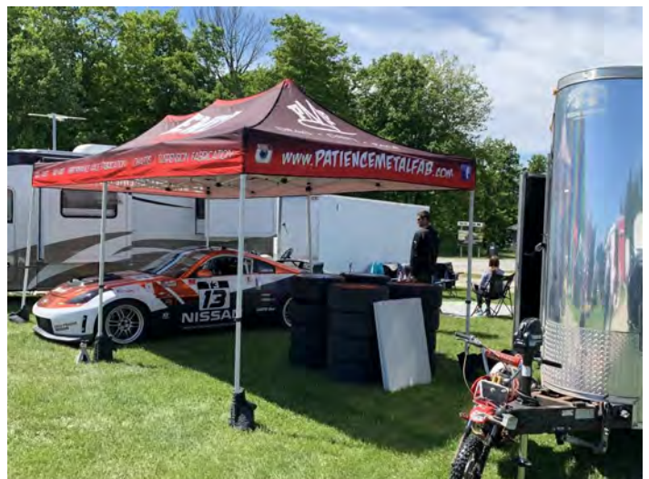
Road America June Sprints

WCZC shirts can be ordered directly from Cherokee Rose Embroidery. 630.941.3305. See the WCZC Website, for more information