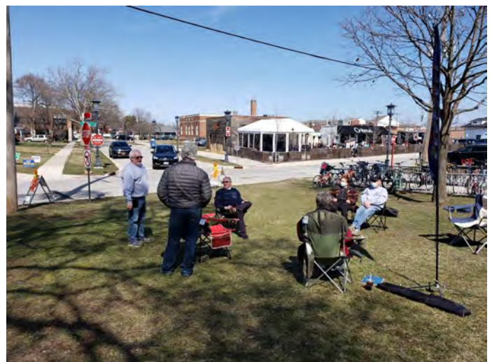
Villa Park Event

WCZC shirts can be ordered directly from Cherokee Rose Embroidery. 630.941.3305. See the WCZC Website, for more information