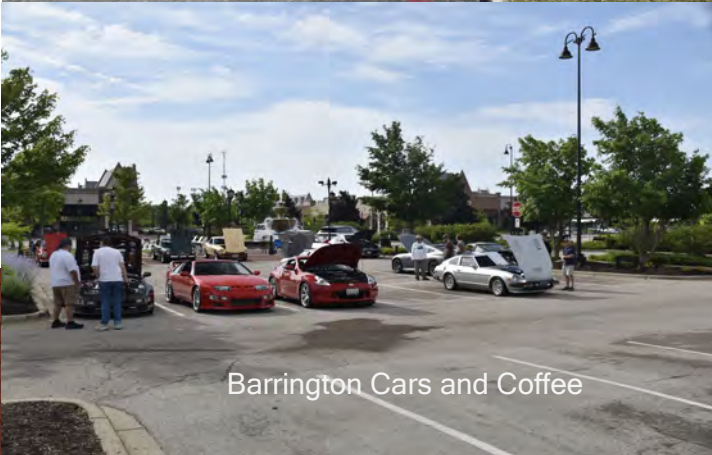
Barrington Cars and Coffee